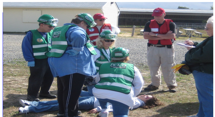
Above, Lyndhurst CERT members perform basic first aid during the recent disaster drill demonstration held at the New Jersey State Police Training Academy.

The tragic events of September 11th remind us that disaster can strike anywhere or anytime, and that basic safety and disaster survival skills can mean the difference between life and death. CERT training empowers community members to prepare responsibly and respond appropriately when emergencies occur. If we can predict that emergency services will not meet immediate needs following a major disaster, especially if there is no warning as in an earthquake, and people will spontaneously volunteer, what can government do to prepare