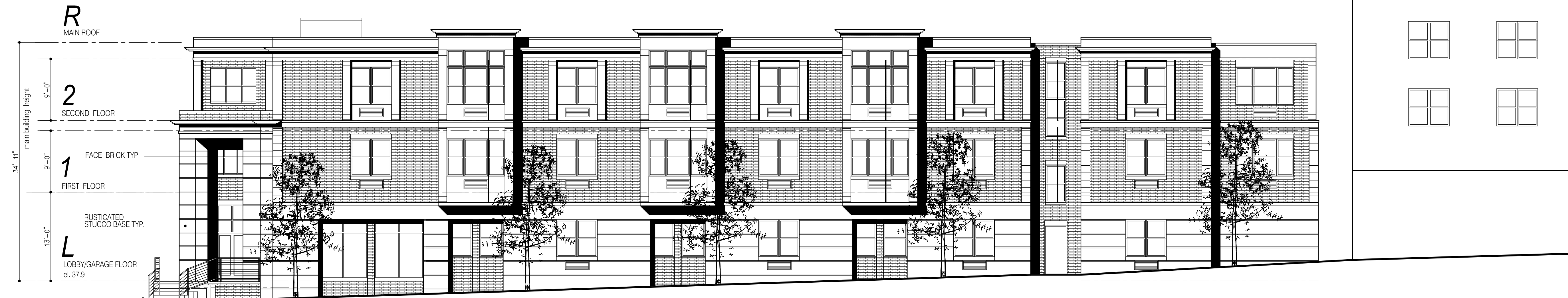
Valley Brook Avenue (Front) Elevation