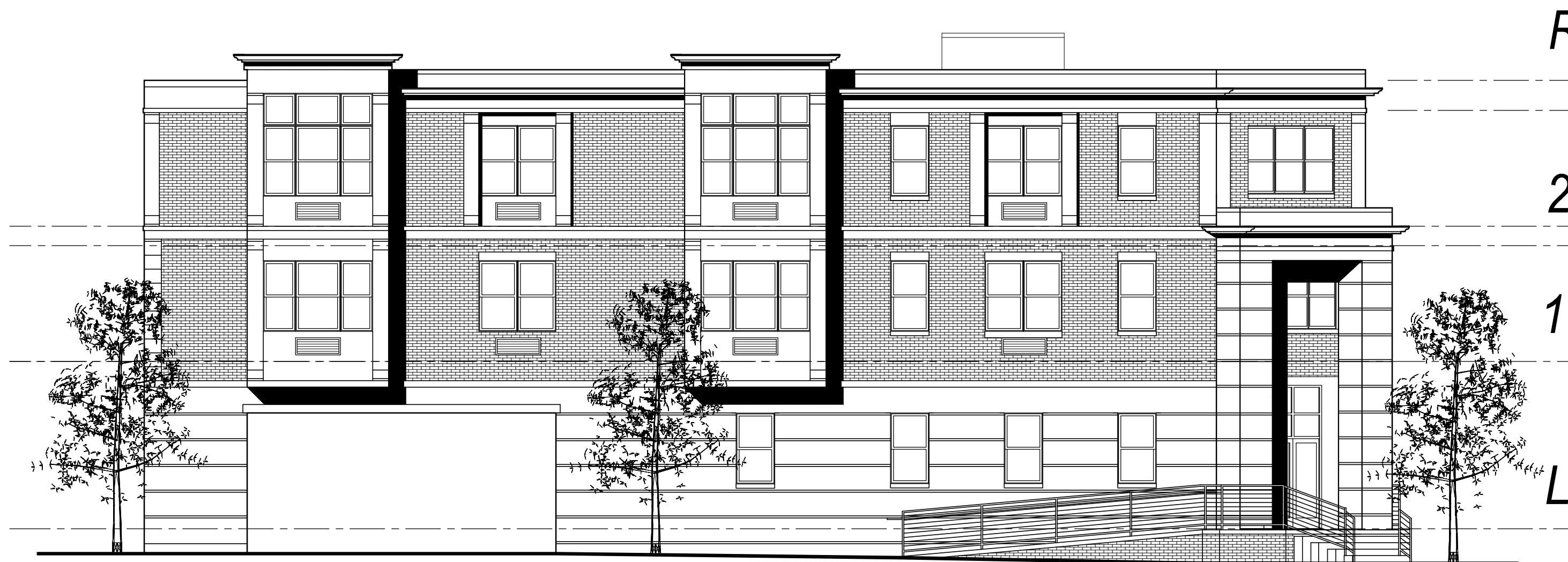
Livingston Avenue (Left Side) Elevation