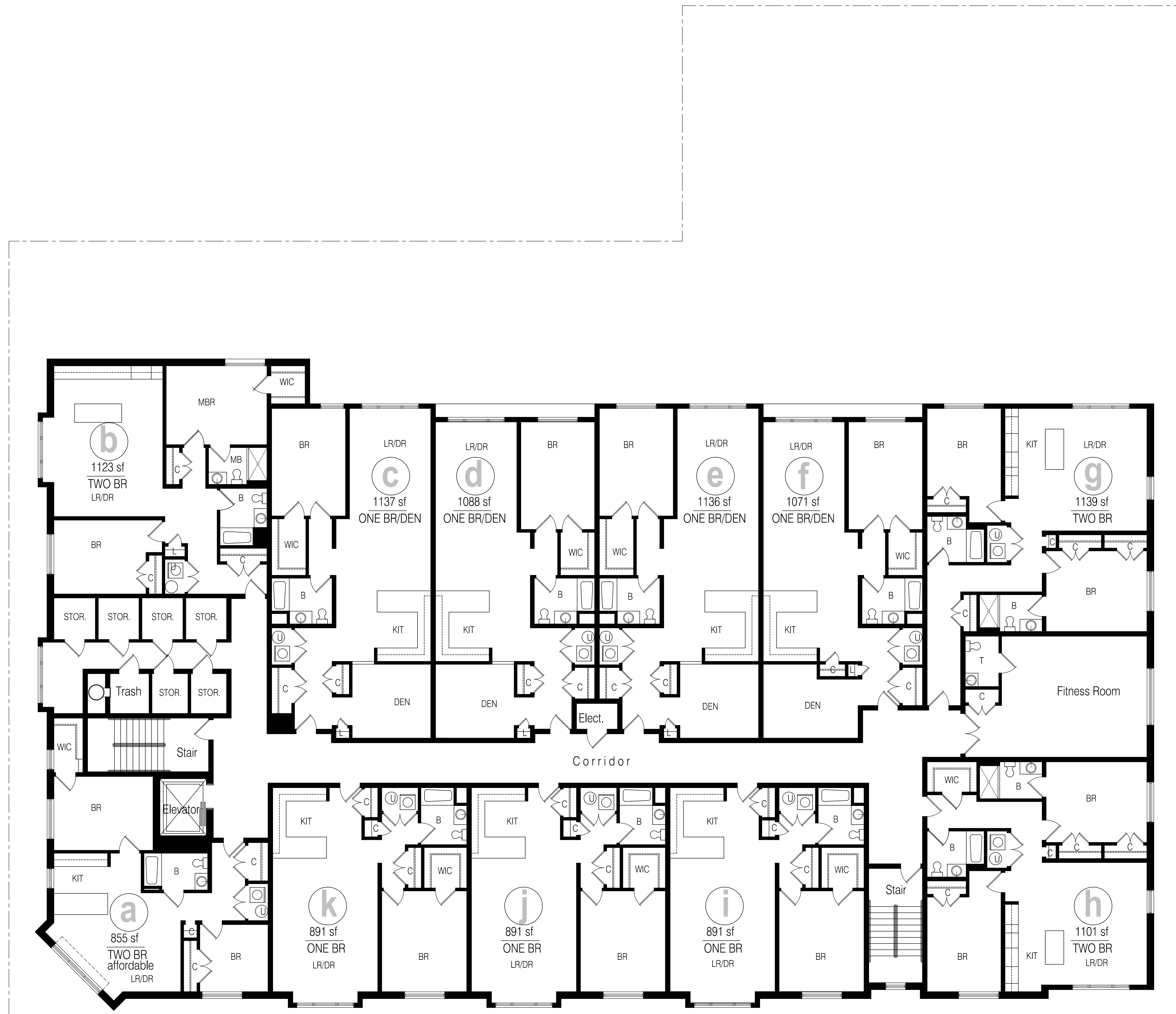
Typical Floor Plan (2 + 3)