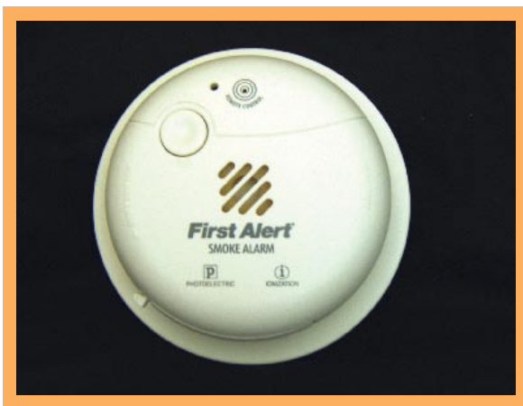
Figure 1: A smoke alarm for people who are blind or have low vision. This alarm comes with a 10-year battery and is tested and silenced by remote control.

You need at least one smoke alarm outside every sleeping area and on every level of your home. The most dangerous fires occur when you are sleeping. The smoke alarm should detect the smoke before it reaches your sleeping area and wake you up.