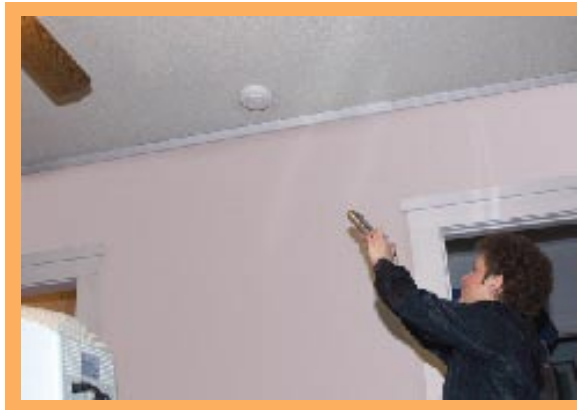
Figure 2: Point the remote toward the alarm.

To test the alarm, point the remote control at it. Hold down the volume or the channel button for 3 to 5 seconds (see Figure 2).