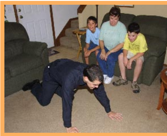
Figure 5: Practice crawling to get under smoke.

If the door does not feel hot, open it with caution. There still may be smoke and heat on the other side. If you open the door and find smoke or heat, close the door, and use your second way out. If the path to the outside is clear of smoke, or if you can crawl under the smoke, move quickly to the exit (see Figure 5).