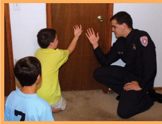
Figure 4: Feel the door with the back of your hand.

If the door does not feel hot, open it with caution. There still may be smoke and heat on the other side. If you open the door and find smoke or heat, close the door, and use your second way out. If the path to the outside is clear of smoke, or if you can crawl under the smoke, move quickly to the exit (see Figure 5).